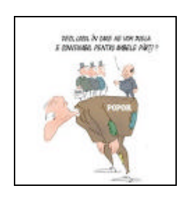
Figure 18. CN (Feb. 20<sup>th</sup>)