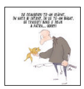
Figure 6. CN (Jan. 11th.)