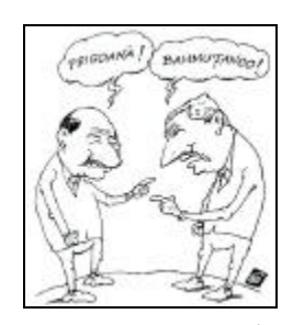
Figure 5. Z (Feb. 22<sup>nd</sup>)