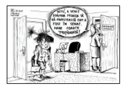
Figure 2. JN (Feb.15<sup>th</sup>)