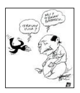
Figure 16. Z (Feb 12<sup>th</sup>)