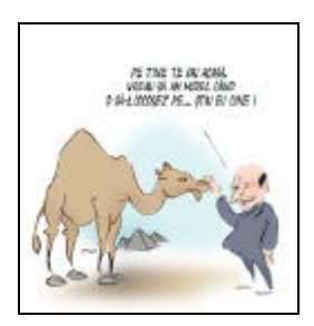
Figure 7. CN (Feb. 23<sup>rd</sup>)