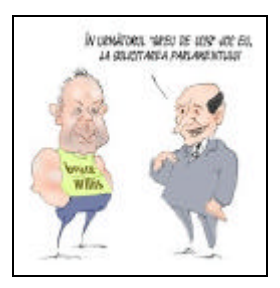
Figure 4. CN (Feb. 19<sup>th</sup>)