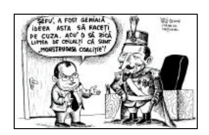
Figure 14. JN (Jan. 31st)